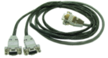
NERLITE "Y" Cable